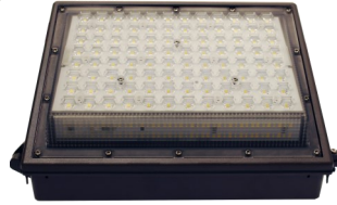
Bottom LED array ensures seamless coverage in proximity of the fixture